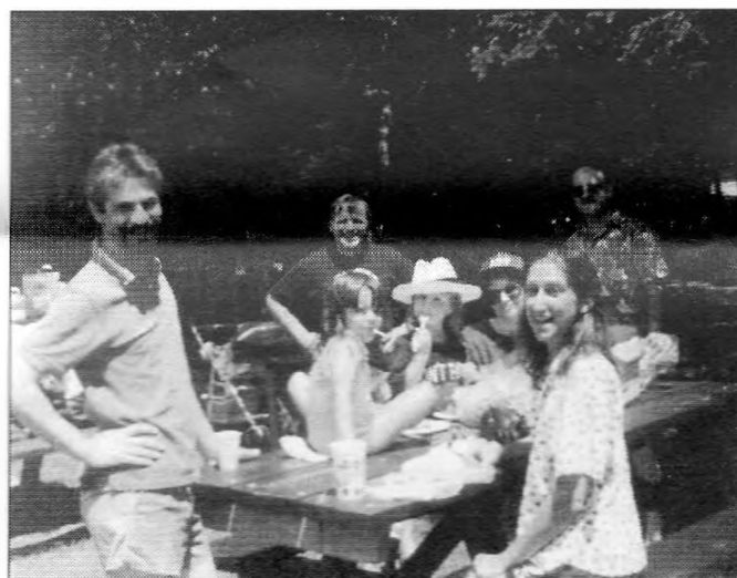
— BETH EL BEACH DAY —

The Officers and Board of Directors of Congregation Beth Israel extend to the Community wishes for a healthy and prosperous New Year. May 5757 be a year of friendship and cooperation.